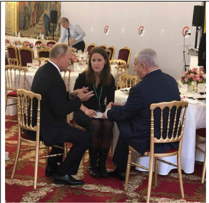
Russia's Putin (L) and PM Netanyahu

The Israeli leader also said he favored reaching an "arrangement" that would avoid an all out war with Gaza and stave off a deepening humanitarian crisis.