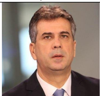
Minister of the Economy and Industry Eli Cohen

Almost 13 years after the Gulf state announced it will no longer participate in the Arab boycott of Israel, Bahrain invites Minister Eli Cohen to participate in Startup Nations Ministerial event.