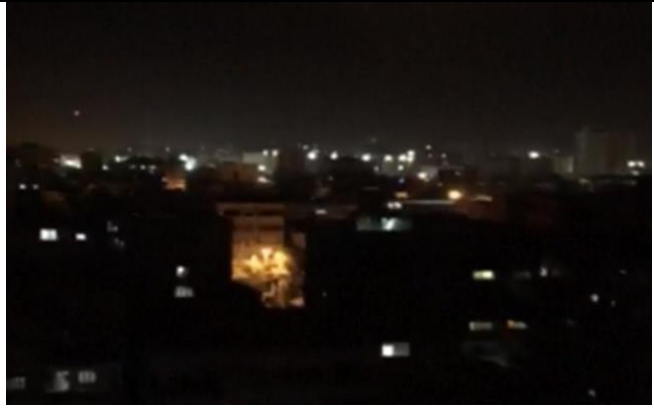
IDF strikes in Gaza, November 11, 2018

An Israeli special forces officer was killed and another was moderately wounded during a night-time operation in the Gaza Strip on Sunday, the army said. The incident sparked intense clashes between the Israeli military and the Hamas terror group.